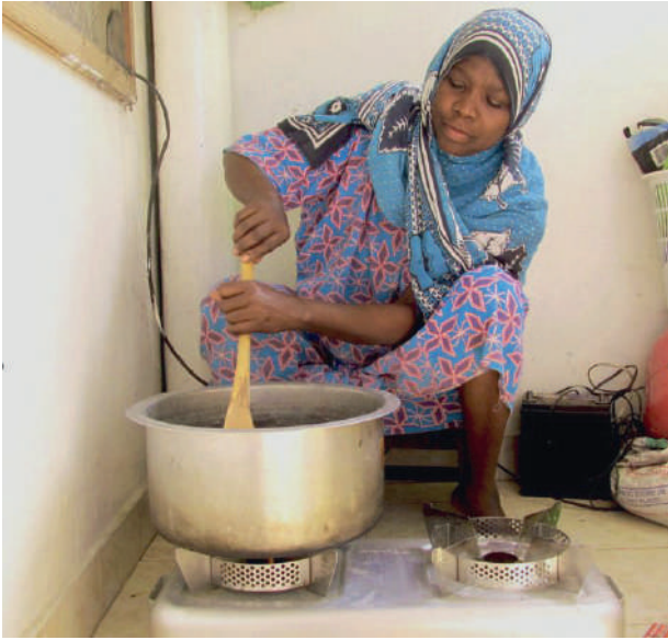
Zanzibar, woman cooking using the Cleancook stove.